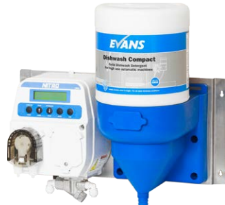
Dosing unit D046AEV Adaptor D047AEV